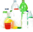
#1 & #2 Plastics