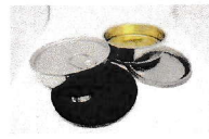
Loose Metal Jar Lids