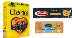
Paperboard Boxes (cereal, pasta, tissue, etc.)