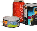
Aluminum, Metal & Beverage Cans