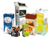
Milk, Juice Cartons, etc.

ALL of these Recyclables Belong in the Curbside Recycling Container: